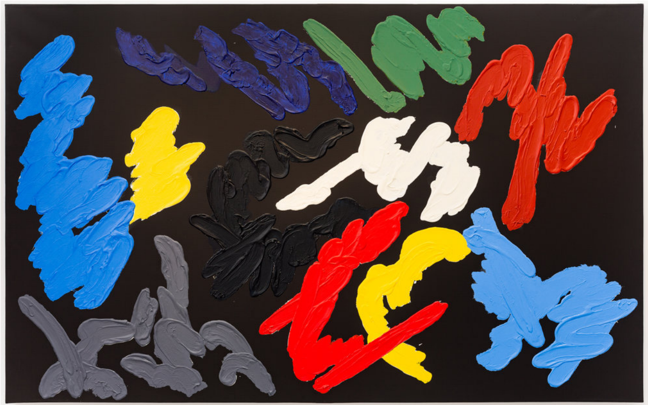
Noir. Acrylic on canvas, 1983.